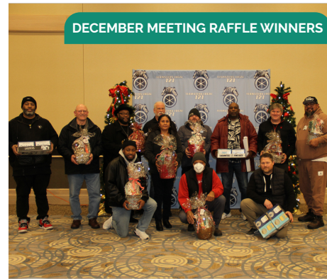
DECEMBER MEETING RAFFLE WINNERS