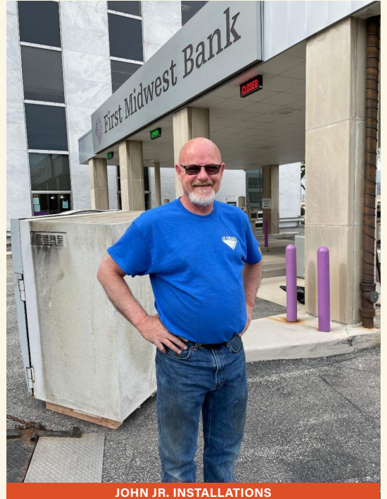
JOHN JR. INSTALLATIONS