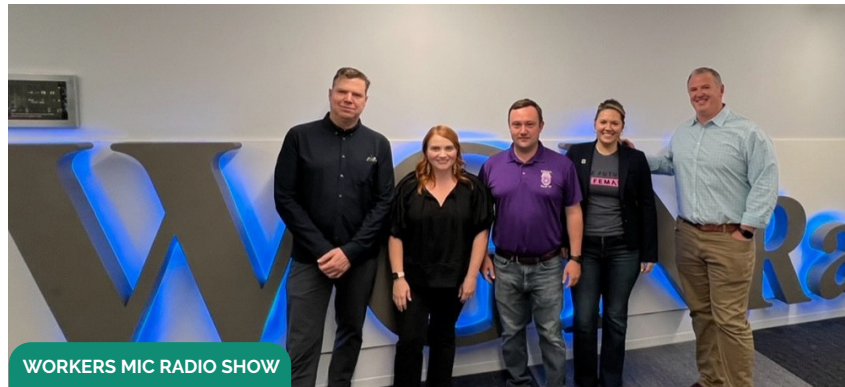
WORKERS MIC RADIO SHOW