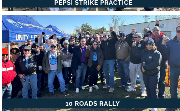
10 ROADS RALLY