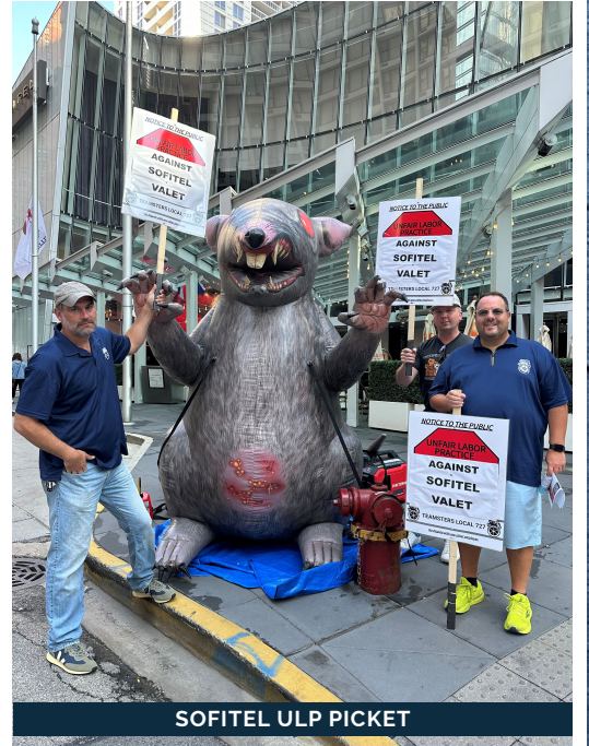
SOFITEL ULP PICKET