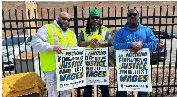
PEPSI STRIKE PRACTICE