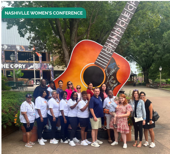
NASHVILLE WOMEN'S CONFERENCE