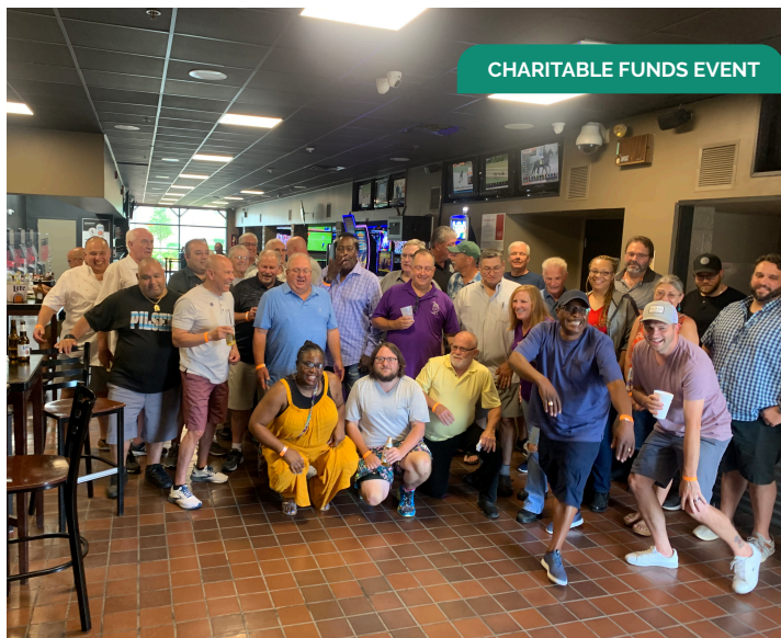
CHARITABLE FUNDS EVENT