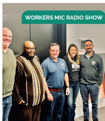
WORKERS MIC RADIO SHOW